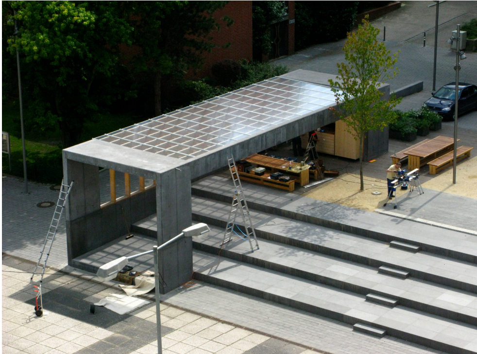
views of the community pavilion