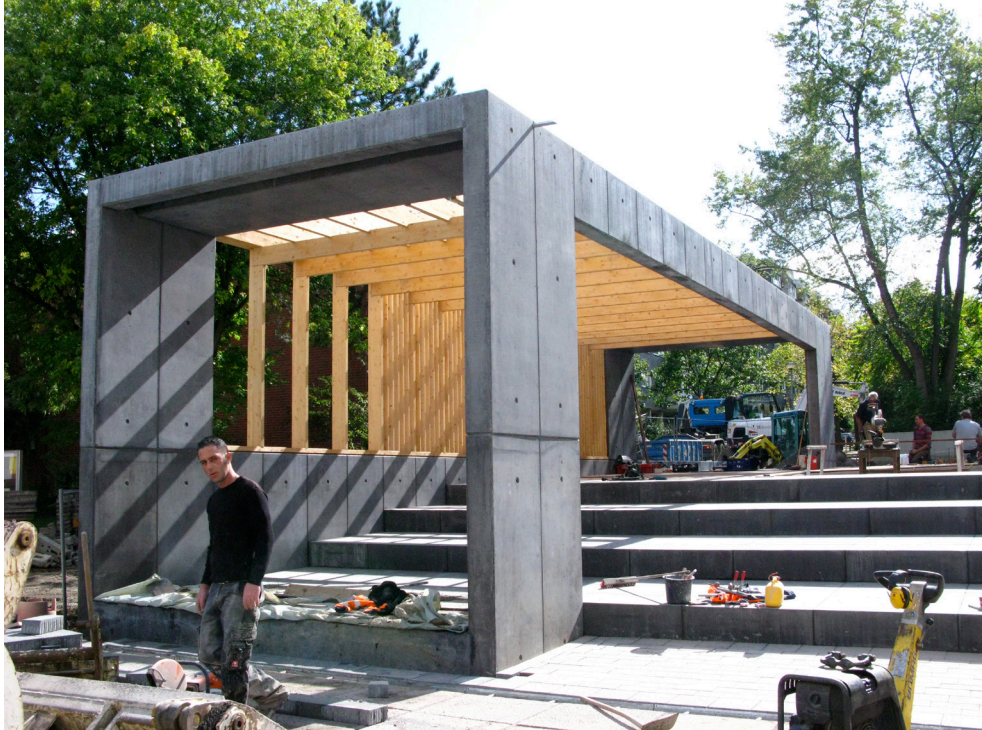
community pavilion - building site