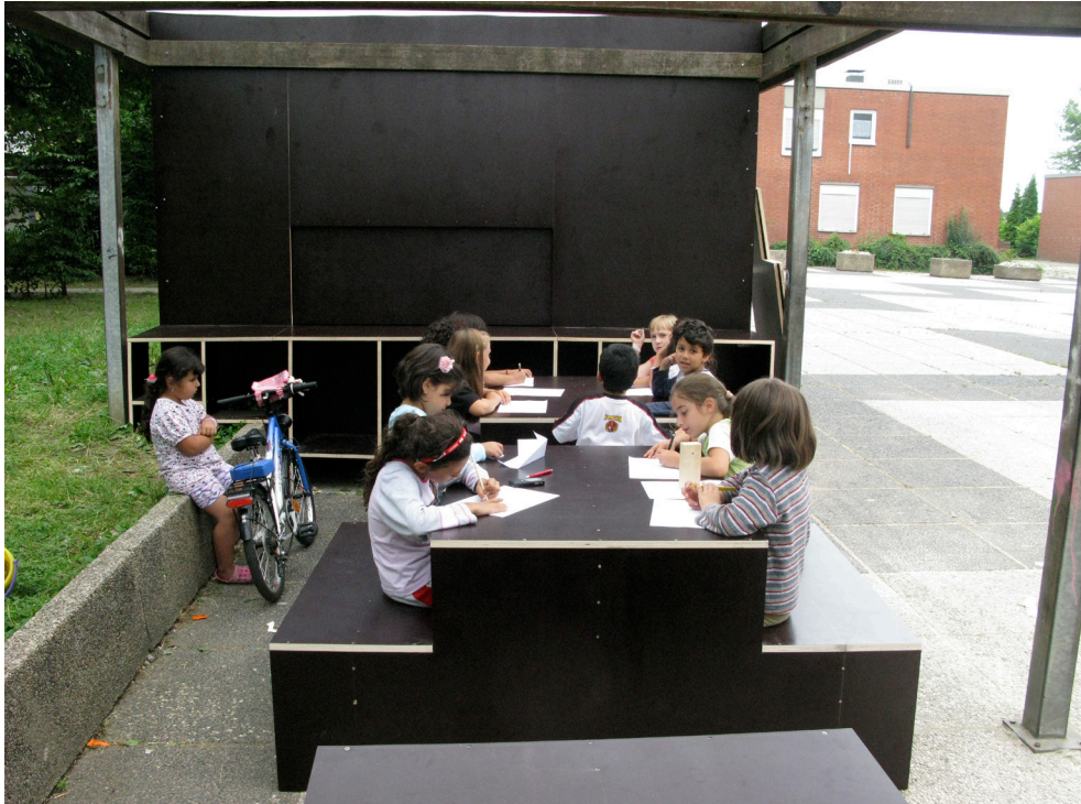
children using the pavilion