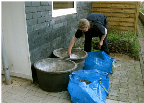
garden for the future