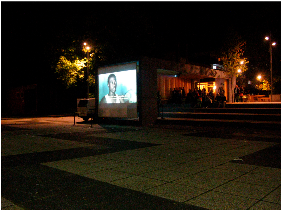
open air cinema