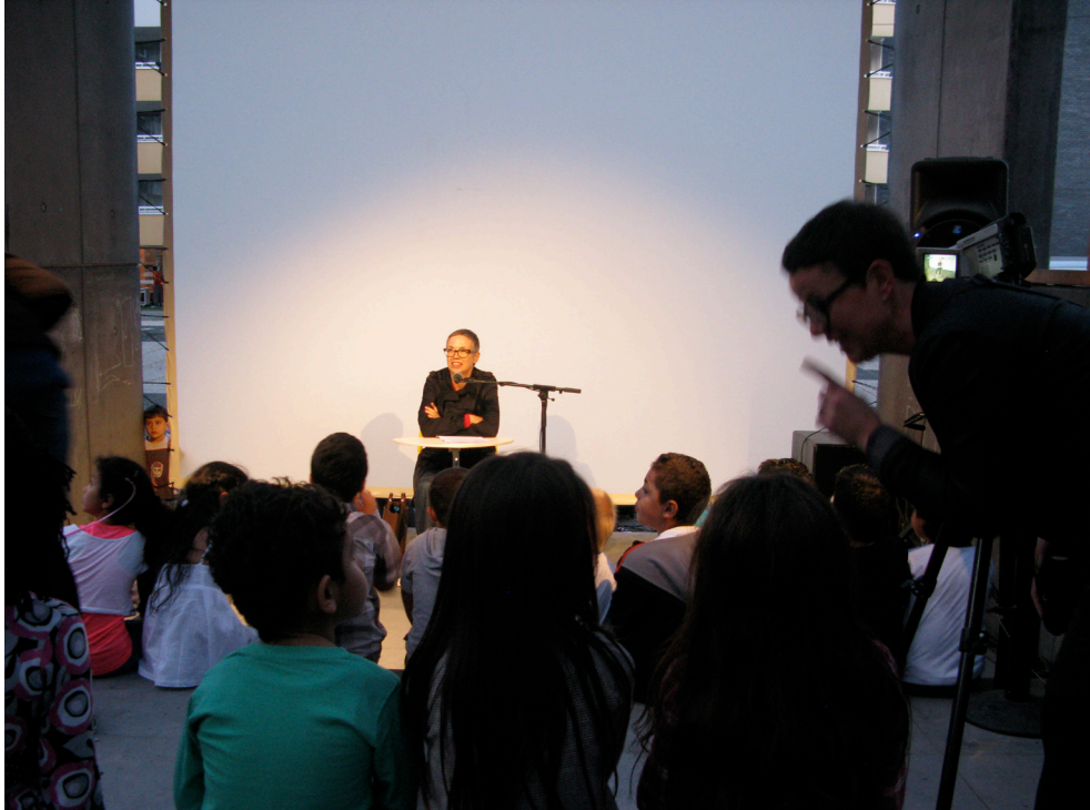
open air lecture