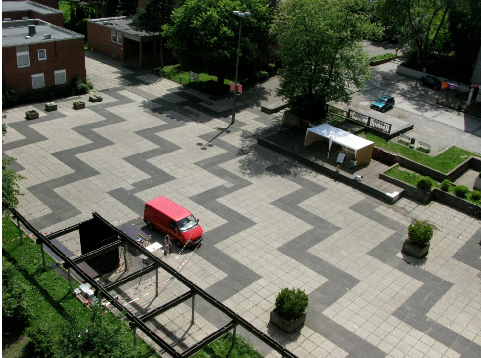
temporary pavilion: building process