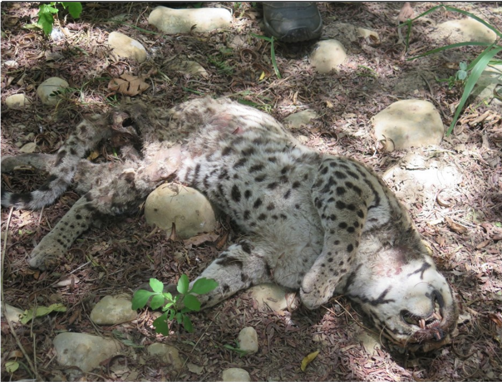
Photo 2. Dead tigrillo on the old bed of the River Bruno.

On the old bed of the river, completely dry now, we found a dead tigrillo (Photo 2), a kind of ocelot, that gave the desperate impression of solitude and desolation, the feeling of being in a desert with no water. Funnily enough, Cerrejón corporation said that it has been killed by hunters, one wonders why they didn't take the fur. Similar to the tigrillo , plenty of huge trees seem to be feeling the consequences of the diversion of the river.