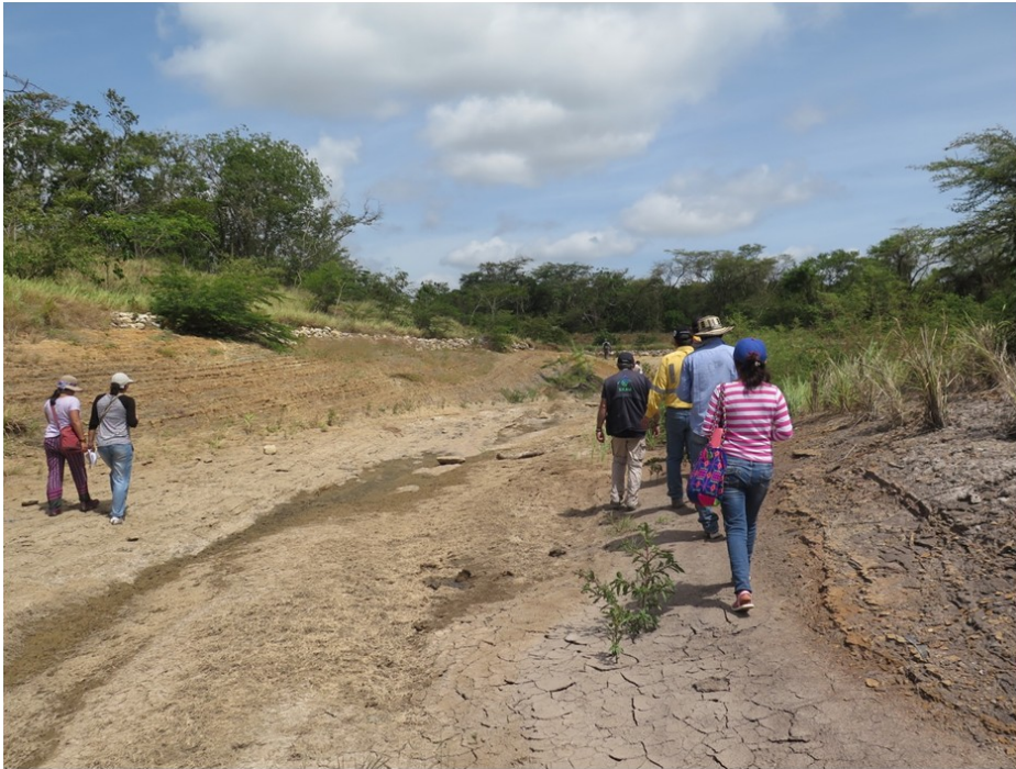
Photo 1: Photo of the institutional and international delegation walking on the new bed of the Arroyo Bruno, diverted by Cerrejón.

Colombia Solidary Campaign has accompanied the struggle of ethnic communities affected by Cerrejón coal mining in La Guajira, north of Colombia, for more than 15 years.